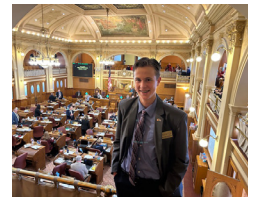
These are the 2024 SDRTL Student Interns!

To receive 'Weekly Capitol Email Updates' please go to our website at www.sdRightToLife.org and fill-in the SUBSCRIBE BOX. We would also appreciate your financial partnership. In doing so you are supporting our presence at the Capitol for the 38-Days of this coming SD Legislative Session. Thank You!